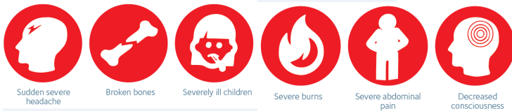
Sudden severe headache