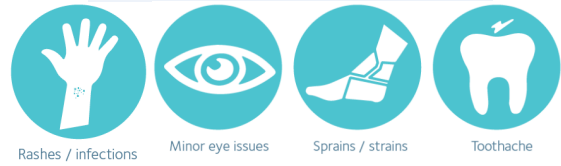
Rashes / infections